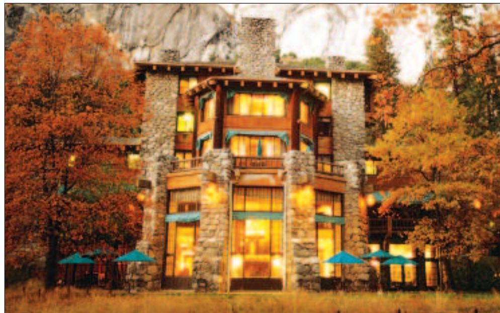
Contractor Delaware North Cos., which operates the Ahwahnee Hotel in Yosemite National Park, is offering special deals on food and lodging in order to spur tourist sales.