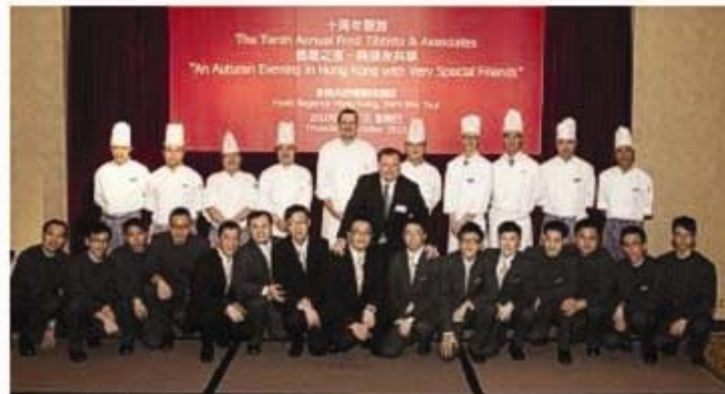
"Twenty-five of the Brigade of the Hyatt Regency Hong Kong, Tsim Sha Tsui that prepared and served the dinner"