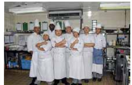
The Grand Millennium KL Kitchen Team